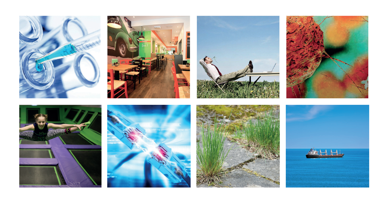
Annual Financial Report For the year ended 28 February 2017 (Registered in England and Wales under company number 07142153)